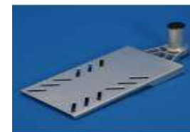
Swivel Seat Mount

Connects to vertical & horizontal rails from .75" – 1.62" diameter.