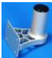
Side Mount Fits Vertical Sidewalls; Optional back plate available.