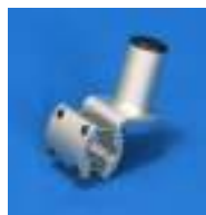
Rail Mount Connects to vertical & horizontal rails from .75" – 1.62" diameter.