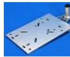
Slider Seat Mount Fits between bottom of seat and top of Slider mechanism.