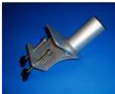
Clamp Mount Connects to Square Rails