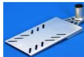
Swivel Seat Mount Fits between bottom of seat and top of pedestal.