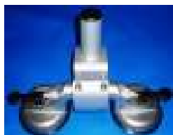
Suction Mount Fits smooth flat surfaces 4.5" x 12.5" Connects to vertical or horizontal surfaces.