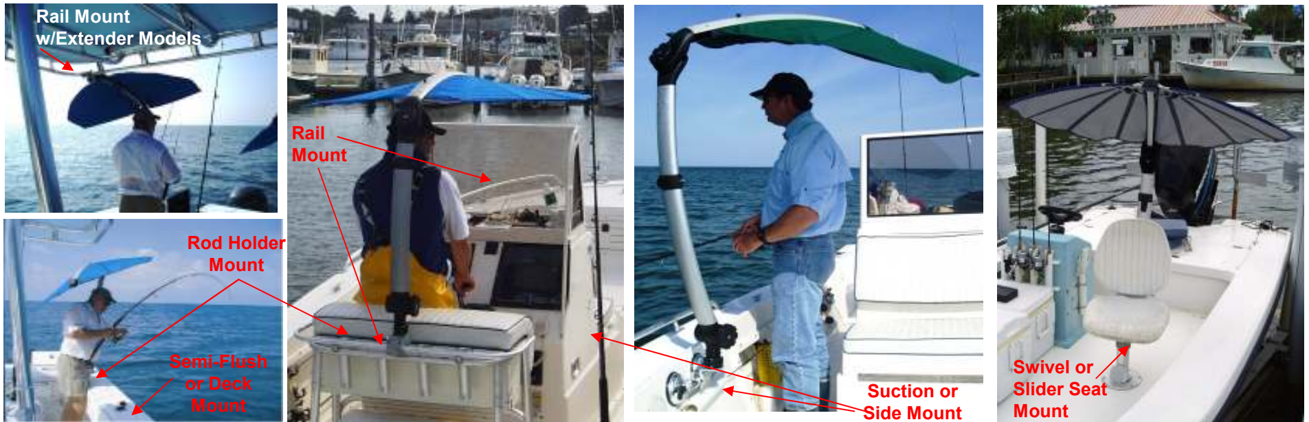
Several Mantis Mounts depending on boat design and your preferences!